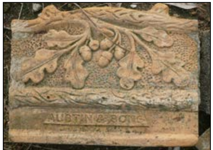
Edging tile, Coburg Cemetery. Maker: Austin & Sons.

Bookings essential. Contact wtodd@gmct.org.au or (03) 9355 3146